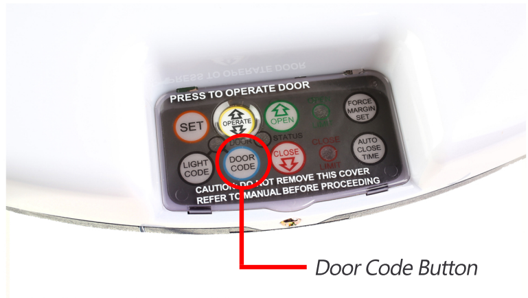
Door Code Button