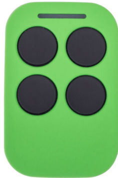
Auto Openers C945